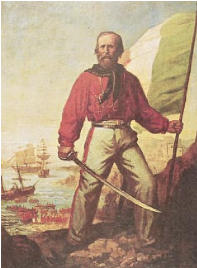
GARIBALDI ARRIVES IN SICILY. The dream of Italian nationalists for a united Italian state finally became a reality by 1870. An important figure in the cause of unification was Giuseppe Garibaldi, a determined Italian patriot. Garibaldi is shown here arriving in Sicily on May 11, 1860, with his band of Red Shirts.

his 1,000 Red Shirts, as his volunteers were called because of their distinctive dress, Garibaldi landed in Sicily on May 11, 1860.